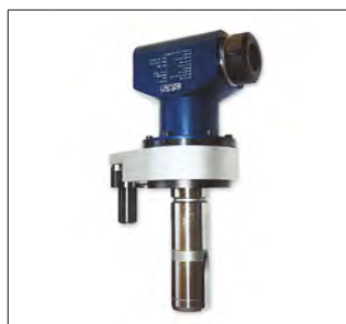
3 RWS Special Input Head