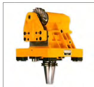
28 DISK HOLDER Special Slotting Head