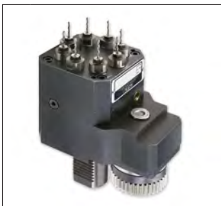
41 AXIAL Special Multi-Spindle