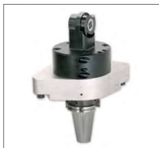
27 DWFK Special Slotting Head