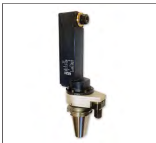
14 RWW Special Offset Head