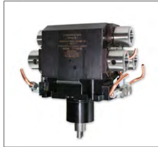
34 RADIAL Opposing Multi-Outputs