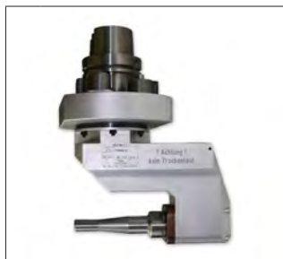
13 RWW Special Offset Head