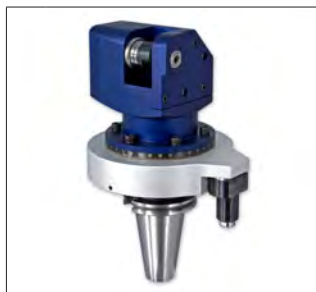
29 CUSTOM OUTPUT 1:2.25 Ratio Head