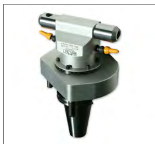
11 RWZ Special Dual Output