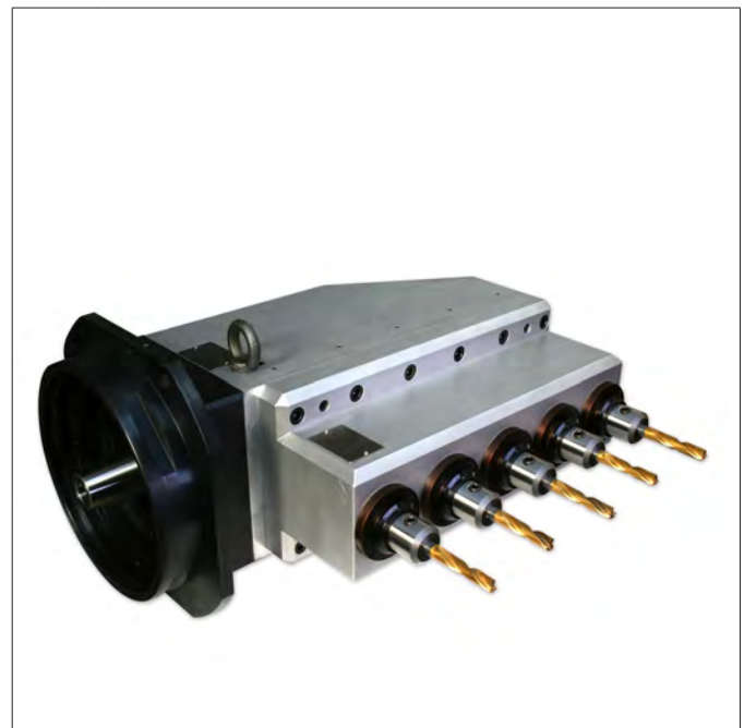
58 TRANSFER MACHINE HEAD Special Multi-Spindle Tool