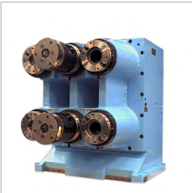
57 ROTARY DIAL MACHINE HEAD Special Large Multi-Output Tool