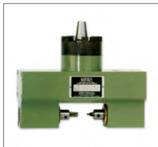
31 DISK HOLDER Special Milling Head