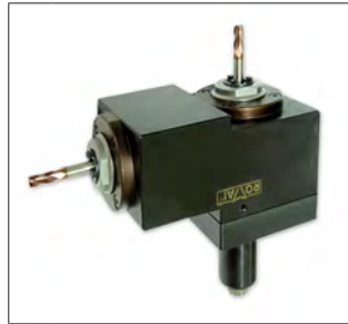
38 RADIAL • AXIAL Okuma LR-45