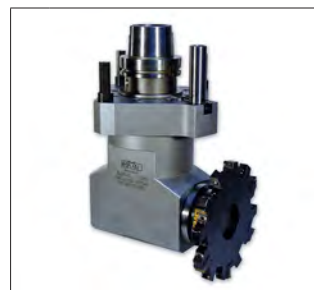
8 RWS Special Mounting/Output