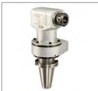
6 RWS Special Arrestor Pin