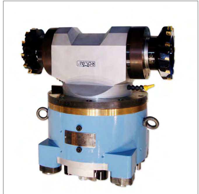
56 HORIZONTAL BORING MILL HEAD Special Dual Cutter Milling Head