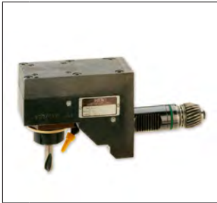
37 RADIAL Special Offset