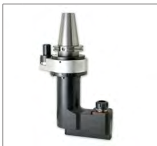
22 RWU "U-Shaped" Head