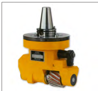
30 RADIAL HOLDER Special Milling Head