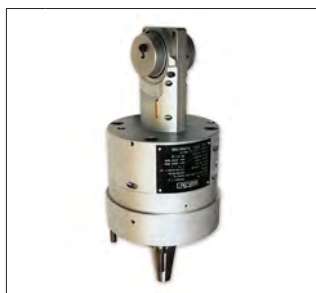
25 DWFK Special Slotting Head