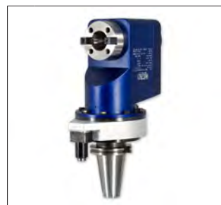
12 RWW 150 CAT 40 Output Head