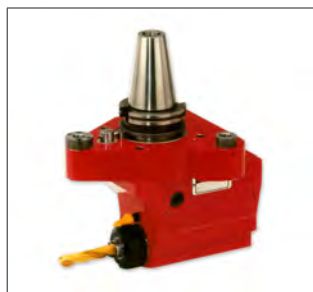
23 RWW Special Offset Head