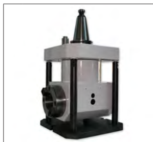
7 RWS Custom Pick-up Station