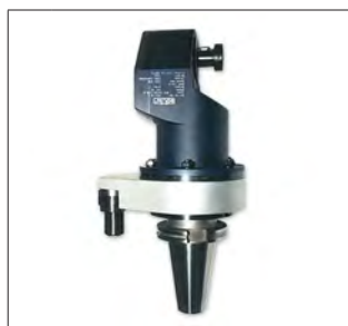
19 RWW Special Output Head