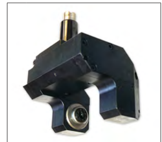
48 DISK HOLDER Special Milling Tool