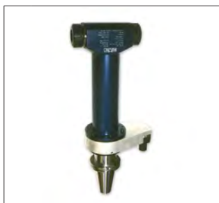
10 RWZ Extended Length • Dual