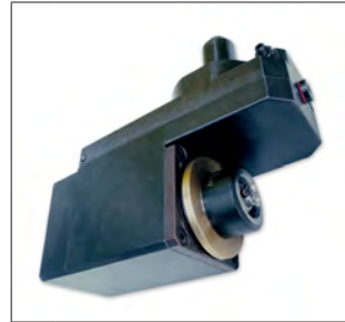
35 RADIAL Special Offset