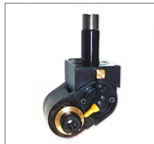
43 Y-AXIS OFFSET Radial • Adjustable