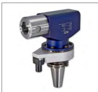
2 RWS 150 Special Output Head