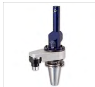
16 RWG Special DWA5.8 Output