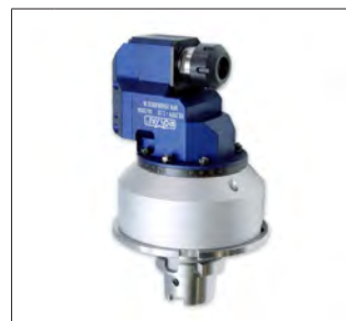
24 WFK Special HSK Input Head