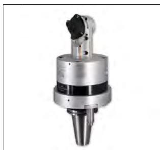
26 DWFK Special Slotting Head