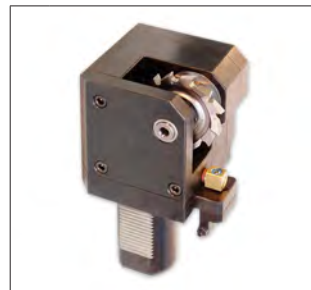
47 DISK HOLDER Special Slotting Tool