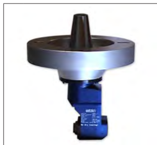
15 RWG Special HBM Head