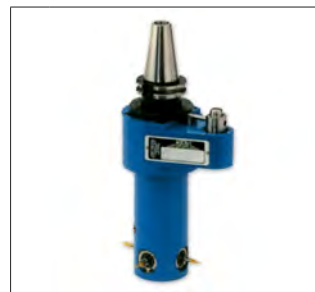
32 DRILL HEAD Special Multi-Spindle