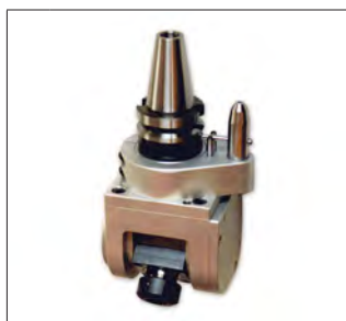
17 RWD Adjustable Angle Head