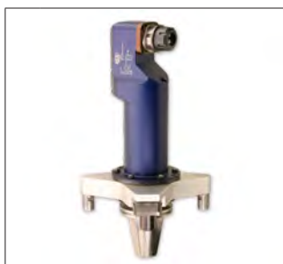
18 RWG Extended Length Head