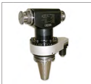
9 RWZ Special Dual Output