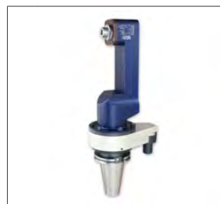
20 RWG FD 1" Collet Output