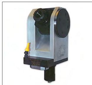
42 ADJUSTABLE Mazak 0-45°