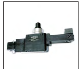
44 AXIAL OFFSET Dual Output Tool