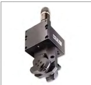
45 AXIAL Special Slotting Tool