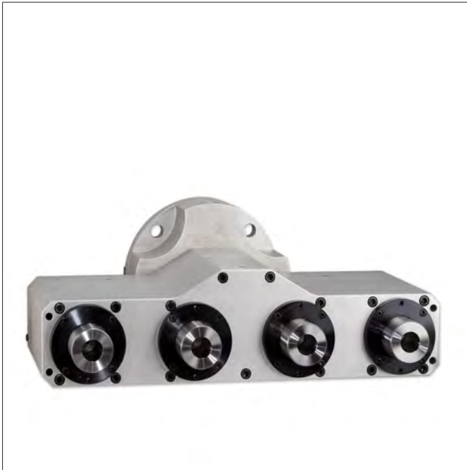
55 HORIZONTAL BORING MILL HEAD Special Multi-Spindle Tool