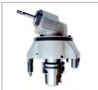
21 WBK 75° Fixed Angle Head