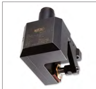
46 1.25" ARBOR Special Slotting Tool