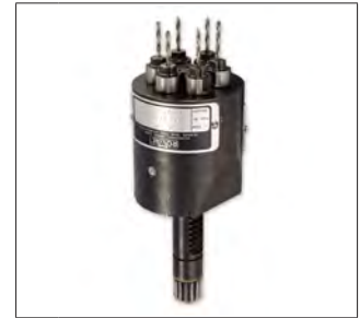
40 AXIAL Special Multi-Spindle