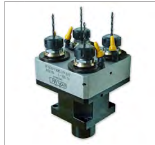
39 AXIAL Special Multi-Spindle