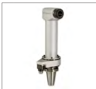
1 RWS 7 Extended Length Head