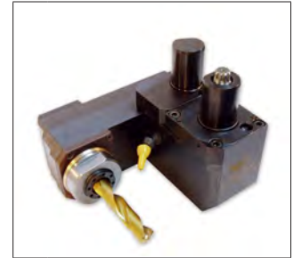
36 RADIAL Custom Offset