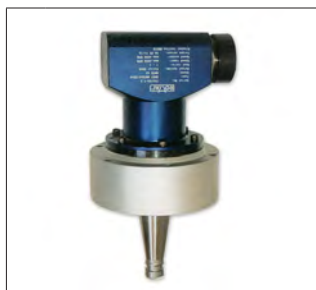
5 RWS Special Flange Mount