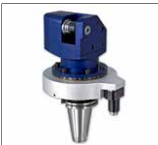
29 CUSTOM OUTPUT 1:2.25 Ratio Head