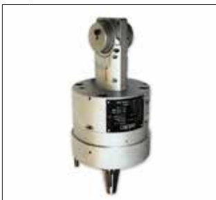
25 DWFK Special Slotting Head