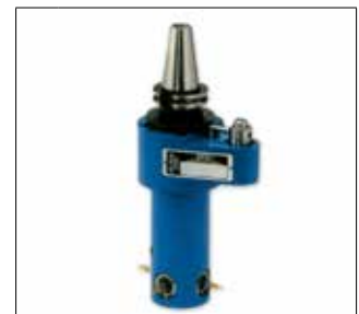
32 DRILL HEAD Special Multi-Spindle