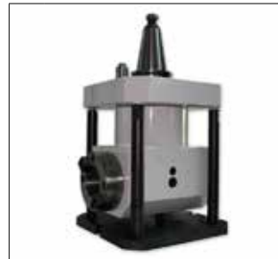
7 RWS Custom Pick-up Station