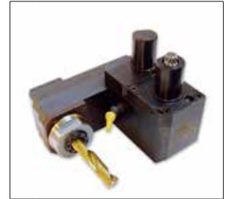
36 RADIAL Custom Offset