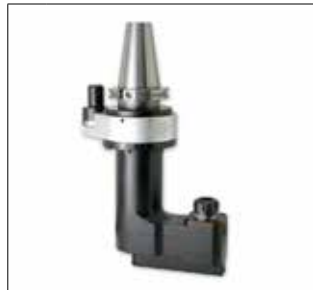
22 RWU "U-Shaped" Head