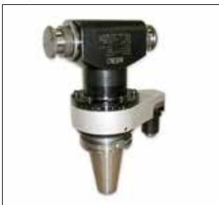
9 RWZ Special Dual Output