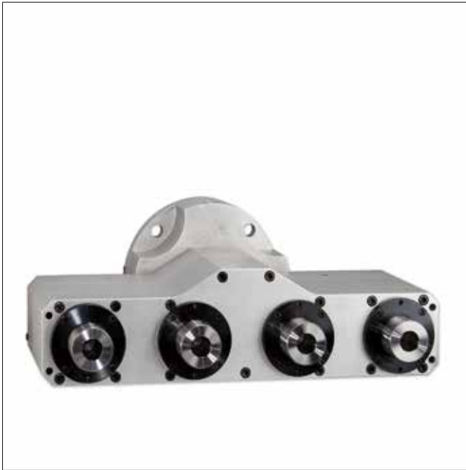
55 HORIZONTAL BORING MILL HEAD Special Multi-Spindle Tool