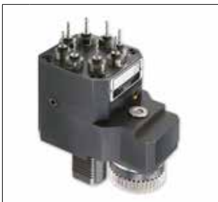
41 AXIAL Special Multi-Spindle