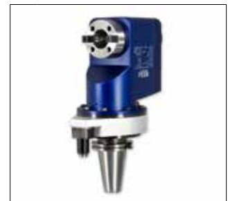
12 RWW 150 CAT 40 Output Head