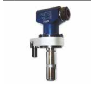
3 RWS Special Input Head