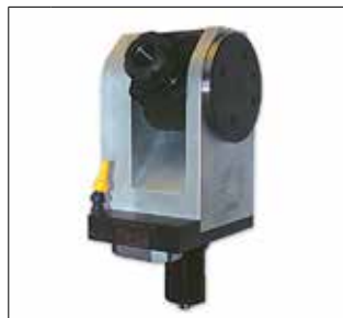
42 ADJUSTABLE Mazak 0-45°