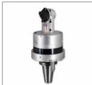
26 DWFK Special Slotting Head