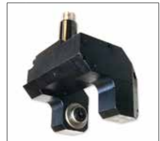
48 DISK HOLDER Special Milling Tool