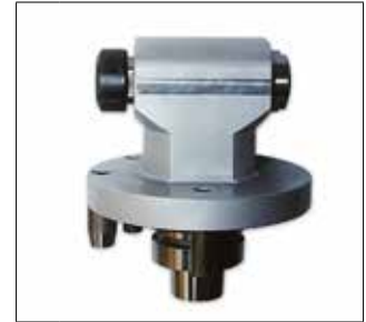
4 RWS Capto Input Head