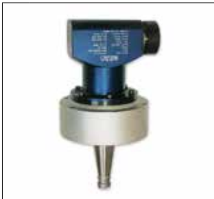
5 RWS Special Flange Mount