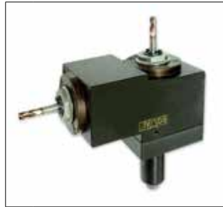
38 RADIAL • AXIAL Okuma LR-45