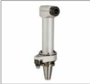
1 RWS 7 Extended Length Head