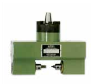
31 DISK HOLDER Special Milling Head