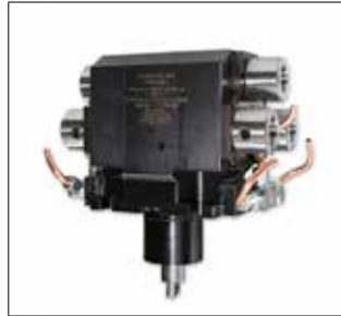
34 RADIAL Opposing Multi-Outputs