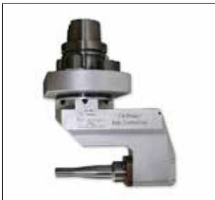
13 RWW Special Offset Head