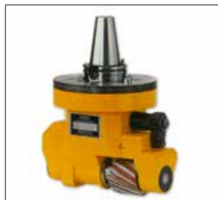
30 RADIAL HOLDER Special Milling Head