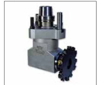
8 RWS Special Mounting/Output