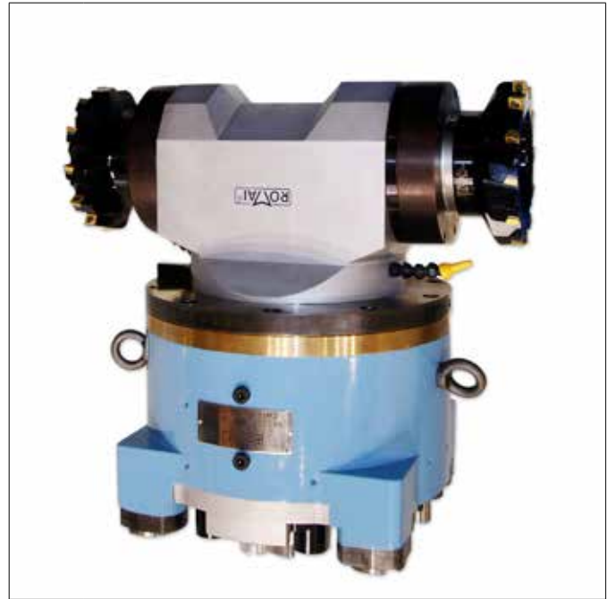
56 HORIZONTAL BORING MILL HEAD Special Dual Cutter Milling Head