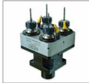
39 AXIAL Special Multi-Spindle