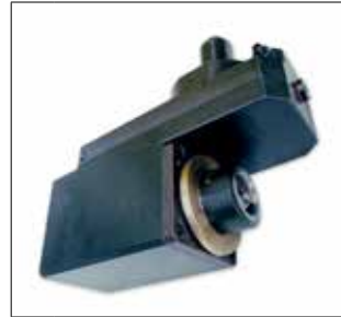
35 RADIAL Special Offset