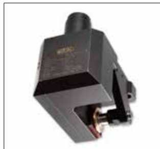
46 1.25" ARBOR Special Slotting Tool