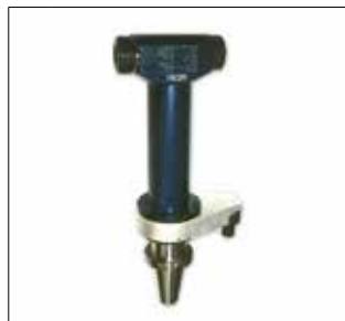
10 RWZ Extended Length • Dual