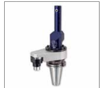
16 RWG Special DWA5.8 Output