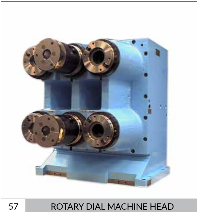
57 ROTARY DIAL MACHINE HEAD Special Large Multi-Output Tool