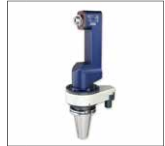
20 RWG FD 1" Collet Output