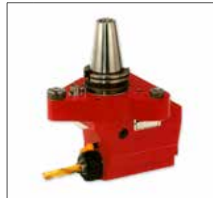
23 RWW Special Offset Head