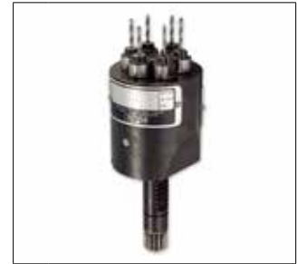
40 AXIAL Special Multi-Spindle