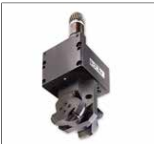
45 AXIAL Special Slotting Tool