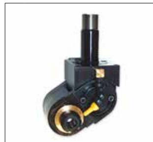
43 Y-AXIS OFFSET Radial • Adjustable