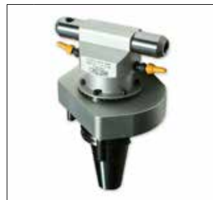
11 RWZ Special Dual Output