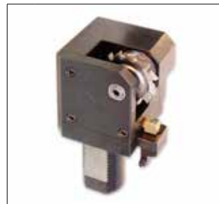
47 DISK HOLDER Special Slotting Tool