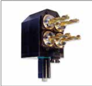
33 RADIAL Special Multi-Spindle