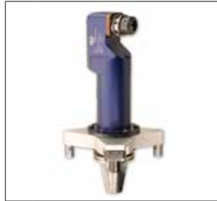
18 RWG Extended Length Head