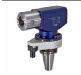
2 RWS 150 Special Output Head