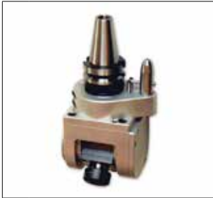
17 RWD Adjustable Angle Head