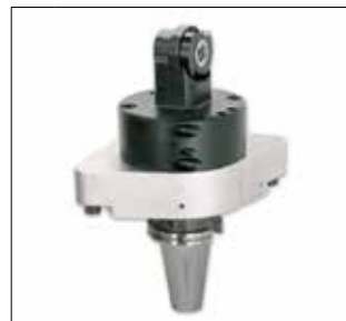
27 DWFK Special Slotting Head