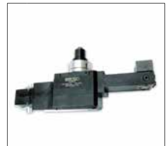
44 AXIAL OFFSET Dual Output Tool