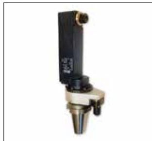
14 RWW Special Offset Head