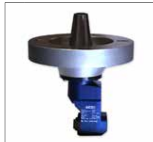
15 RWG Special HBM Head