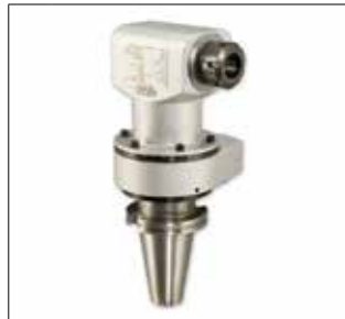
6 RWS Special Arrestor Pin