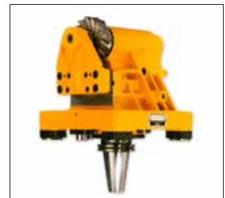
28 DISK HOLDER Special Slotting Head