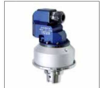
24 WFK Special HSK Input Head