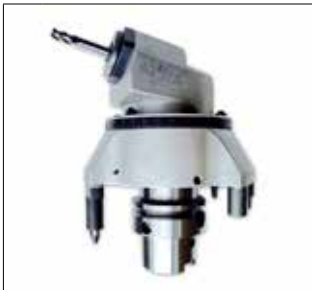
21 WBK 75° Fixed Angle Head