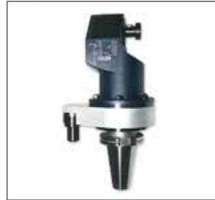
19 RWW Special Output Head