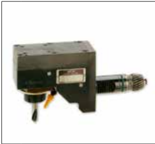
37 RADIAL Special Offset